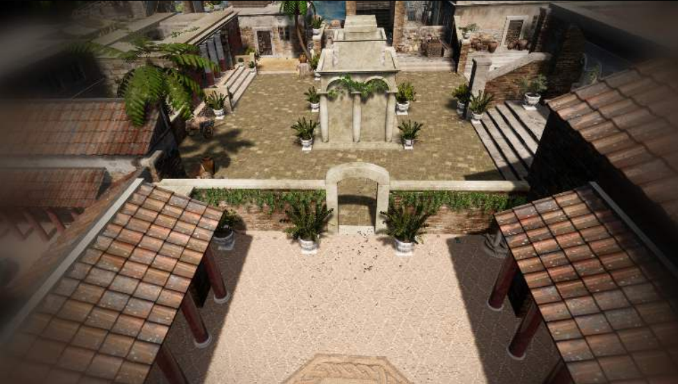
6.ROMAN REPUBLIC - GADES -