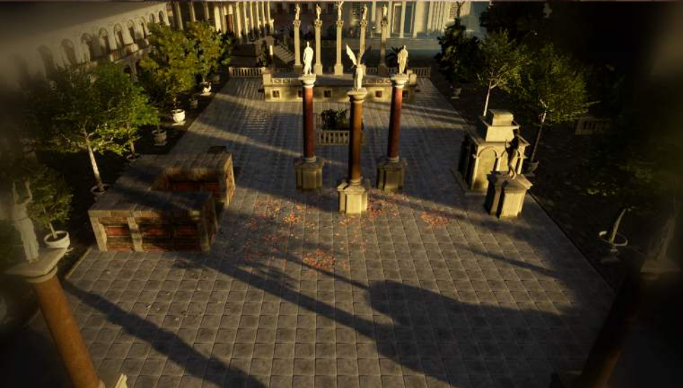
7.THE ROMAN EMPIRE - PAX ROMANA -