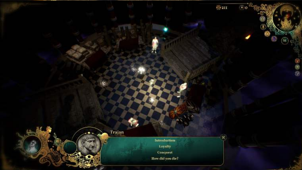
8.TIMES IMMEMORIAL - ROMAN EMPERORS -